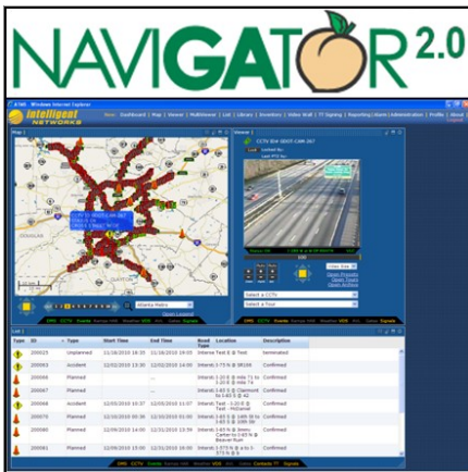
GDOT's NaviGator 2

Earlier this year, the Georgia Department of Transportation launched the first phase of NaviGator 2, replacing the former Intelligent Transportation System (ITS). The system was deployed at the Georgia statewide TMC in Atlanta and at a variety of satellite centers. NaviGator 2 enables the sharing of information between GDOT and partner jurisdictions to facilitate traffic management at a variety of governmental levels.