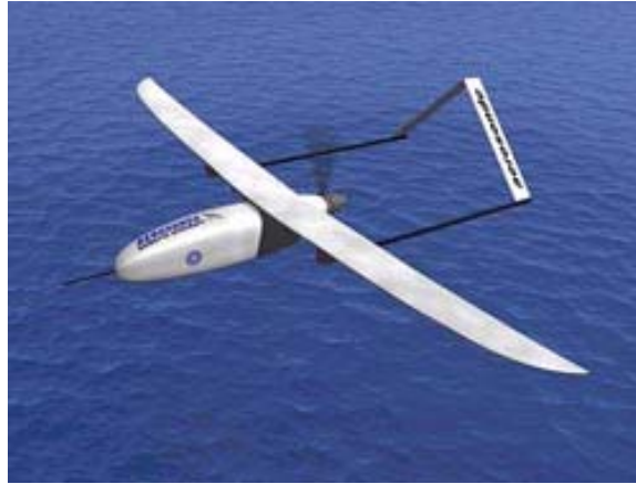
Figure 1. The Aerosonde UAV in Flight