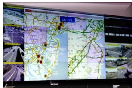
Figure 4: Vehicle Probe Monitoring Site displayed at the TOC

Vehicle probe data is displayed for traffic monitoring purposes at the two state Transportation Operations Centers (TOCs). Operators have five monitors at their stations; one of those monitors has the vehicle probe data displayed at all times. The main displays within the TOCs include the Vehicle Probe monitoring site for New Jersey. The NJDOT uses the monitoring site to identify incidents, improve response time and reduce delay.