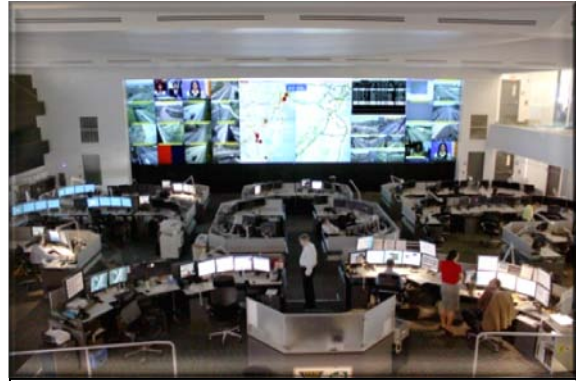
Figure 2: NJDOT's Woodbridge TOC

New Jersey then went beyond its original core coverage and used the contract to add 424 miles of limited access roadways; New Jersey now has full coverage of its limited access roadways. The vehicle probe data system now covers nearly 1000 miles, about 35 percent of the total centerline miles of roadway in New Jersey.