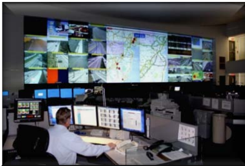
Figure 3: TMC Operator Station

Vehicle probe data is displayed for traffic monitoring purposes at the two state Transportation Operations Centers (TOCs). Operators have five monitors at their stations; one of those monitors has the vehicle probe data displayed at all times. The main displays within the TOCs include the Vehicle Probe monitoring site for New Jersey. The NJDOT uses the monitoring site to identify incidents, improve response time and reduce delay.